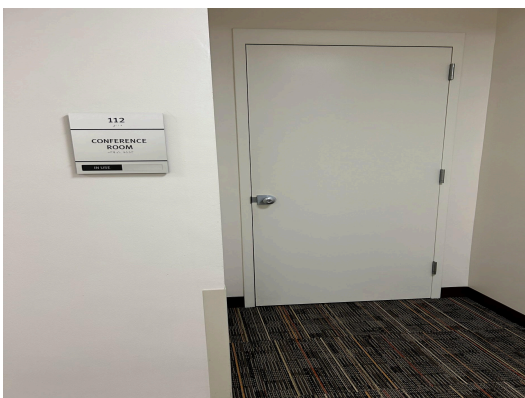
This is the conference room for the president's meeting.