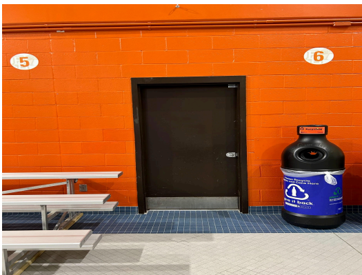
This is the entrance for the president's meeting.

Please have a club representative attend the President's Meeting each session. The President's meeting will take place in a conference room located behind the deck room 112